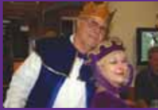
Mardi Gras Casino Night page 6