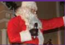
Christmas Treelighting page 6