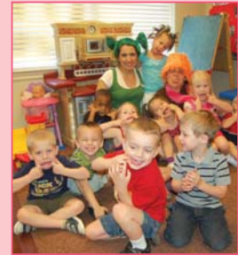
In April the Providence location celebrated "The Week of the Young Child".

The new center is currently hiring and is enrolling children ages 6 weeks to 12 years of age. Visit their website at www.thekidscorral.com for more information.