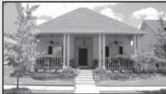
1316 Stone Mountain