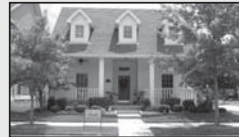
1900 St. Simons