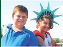
Independence Day Page 8