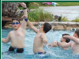
Memorial Day/ Pool Opening Page 8