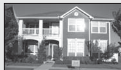
1212 Port Royal Ct.