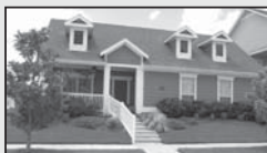
1113 Sea Pines